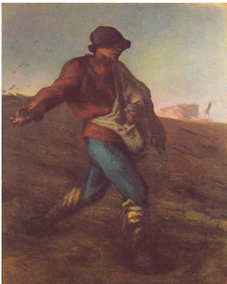
Jean-François Millet, The Sower (1850) Museum of Fine Arts, Boston