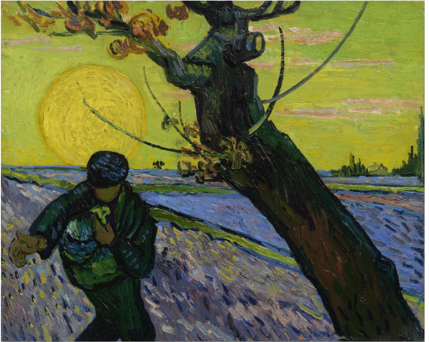
Vincent van Gogh, The Sower (November 1888) Van Gogh Museum, Amsterdam