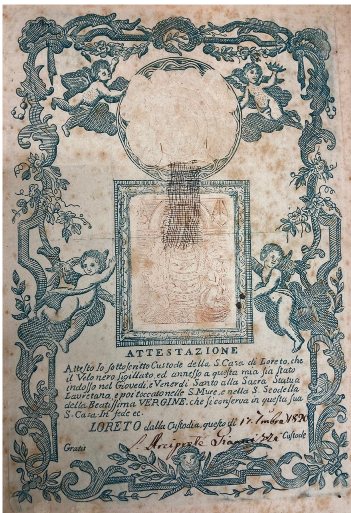
A souvenir of Loreto, from The Wren Library

For details of all events and activities, please see the Chaplains' weekly email.