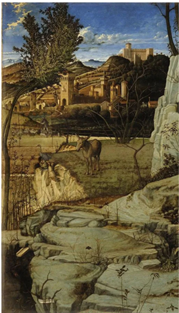
St Francis in the Desert (c. 1475–80) Giovanni Bellini (c. 1424–1516)